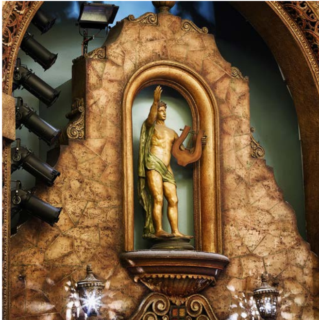
Figure 4a: Interior, Civic Theatre.