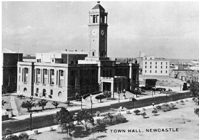
Figure 1: Newcastle Town Hall; Date: c. 1930.