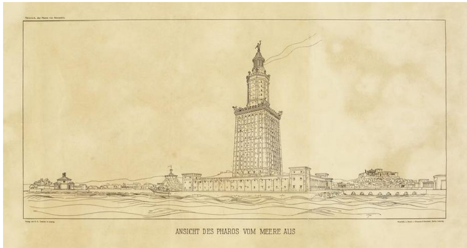
Figure 3: The Lighthouse of Pharos; Designed by Hermann Thiersch; Date: 1909; Source: Pharos Antike Islam und Occident (Berlin: Teubner).

In addition to the Town Hall, Light regarded the Civic Theatre on Hunter Street as his greatest achievement. Also designed by White, the theatre is—in terms of scale—monumental, essentially a two-storey Georgian Revival building with Italian Renaissance elements (most prominent in its repetitive, semi-circular-headed windows). 15 The interior, in Spanish Baroque style, incorporates Classical features, including a proscenium arch adorned with a frieze and recessed arches over the royal boxes containing parapets with inset statues; Apollo on one side and an elegant Graecian female, possibly a Muse or one of the Graces, on the other (Fig. 4a & 4b).