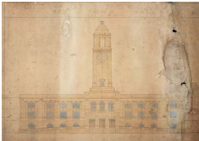
Figure 2b: Plans for Newcastle Town Hall; Scale 1/8" = 1'00"; Approx. Sheet Size: 76cm x 66.3 cm; Detail: Front Elevation; Date: 8.[10]. 1925; Designed by Henry E. White.